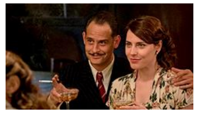
Bye Bye Germany

(Hong Kong – 3 October 2019) The Hong Kong Jewish Film Festival returns for its 20<sup>th</sup> edition with an impressive lineup of films from 2 - 10 November 2019 at the Asia Society Hong Kong Center. The Festival offers an incredibly diverse program with over 20 feature films, comedies, documentaries and shorts from different countries, including Israel, the United States, Canada, Russia, Germany and Ethiopia. Film lovers may explore a wide range of topics from heartwarming family stories to an innovative way of revealing Old Cairo. This is an exciting opportunity to discover Jewish culture, politics, customs, as well as its ancient and modern history. <u>Tickets are on sale now</u>.